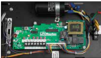
Includes the Medium-Duty Logic Board with Built-In Receiver